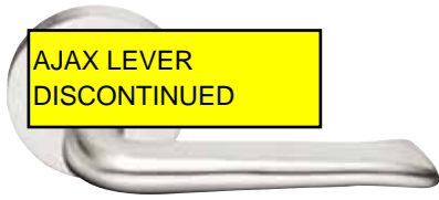
Ajax Lever with Disk Rosette