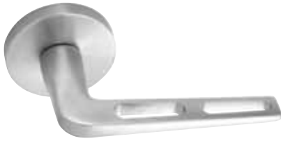
Comet Lever with Disk Rosette