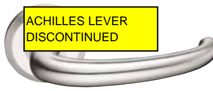
Achilles Lever with Beveled Rosette