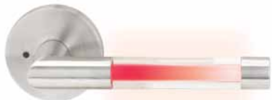
Aurora Fuse Lever