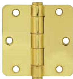
3 1/2" x 3 1/2" Heavy Duty 1/4" Radius Corner