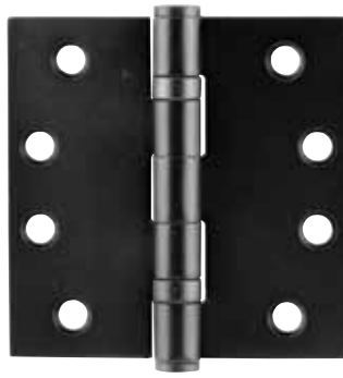
4" x 4" Ball Bearing Square Corner