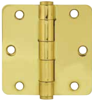
3 1/2" x 3 1/2" Heavy Duty 1/4" Radius Corner