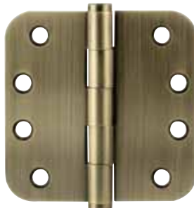
4" x 4" Heavy Duty 5/8" Radius Corner