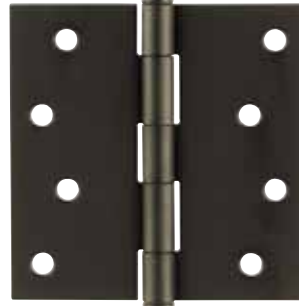
4" x 4" Residential Duty Square Corner