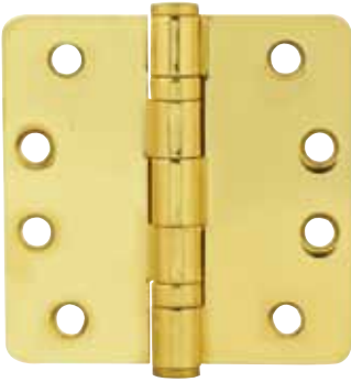
4" x 4" Ball Bearing 1/4" Radius Corner