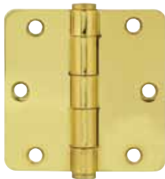
3 1/2" x 3 1/2" Heavy Duty 1/4" Radius Corner