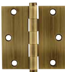
3 1/2" x 3 1/2" Residential Duty Square Corner