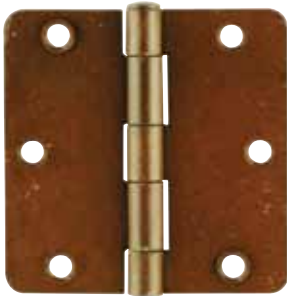
3 1/2" x 3 1/2" Residential Duty 1/4" Radius Corner