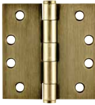
4" x 4" Heavy Duty Square Corner